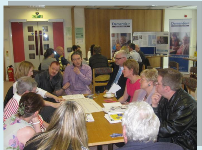
One of the groups at the Conference discusses the issues surrounding long-term management & treatment for those with dementia.

One of the main general issue arising from the day revolved around the end of transportation to day care provision in the borough, people felt that consequently if the service was not reinstated then the diminishing number of people then attending day services would lead to services ceasing to exist. It was said that many people rely on day care to be socially active.