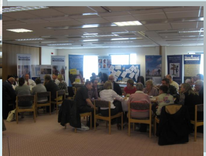
Right: Attendees get involved with shaping the future of Oldham's health and social care services by sharing their ideas and experience of dementia