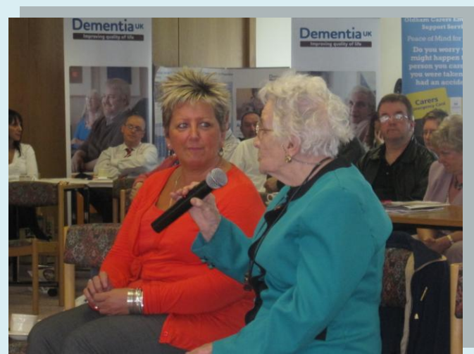
A lady speaks of her own experience of dementia in its early stages